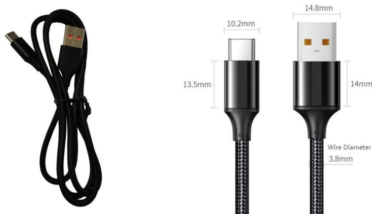
Type-C USB3.0 Cable *1pcs