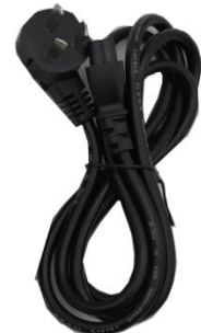
Power Cord * 1 pcs