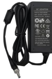
Power Adapter * 1pcs