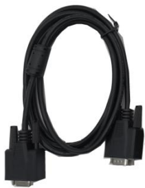
RS232 cable * 1pcs