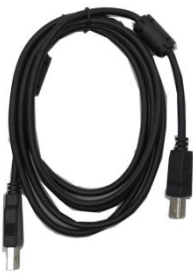
USB Cable * 1pcs